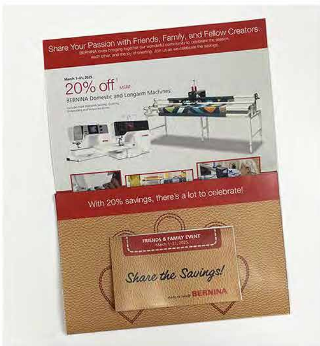
Mailer Open with Tip In