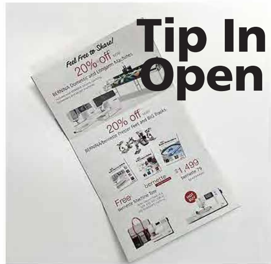
Tip In Open